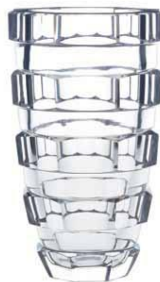
Georges Chevalier crystal vase, 1930