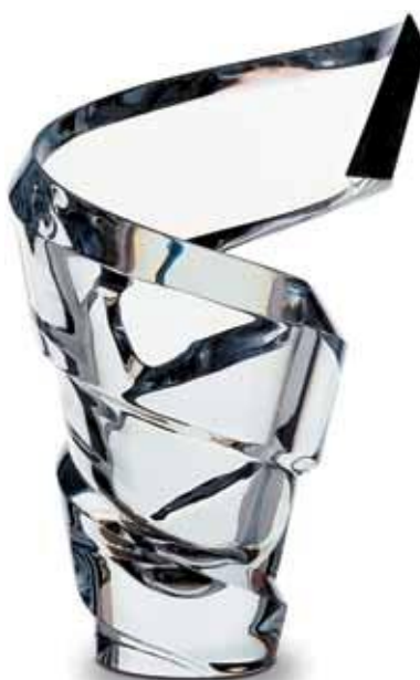
Spirale crystal vase designed by Thomas Bastide