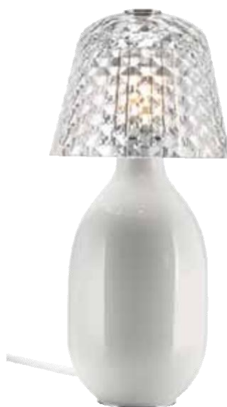
Candy Light Baby designed by Jaime Hayon to be launched at the Salone Internazionale del Mobile, 2013