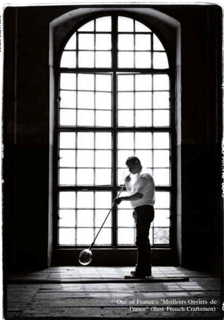
One of France's "Meilleurs Ouvriers de France" (Best French Craftsmen)