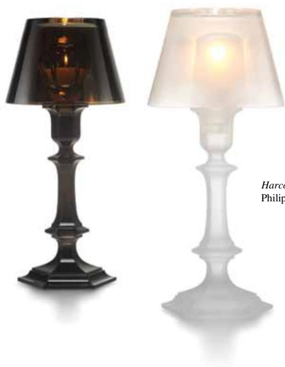
Harcourt Our Fire by Philippe Starck