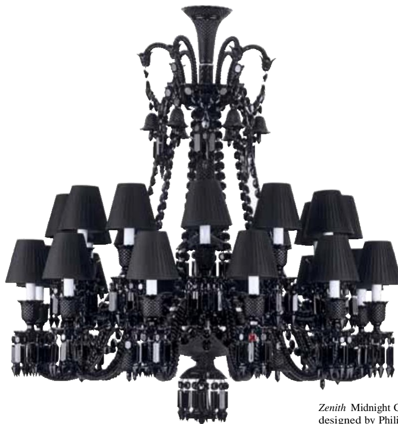
Zenith Midnight Chandelier designed by Philippe Starck

under way. While the company's products have been available in the country for decades through local dealers, the new boutique will specialise in lighting and is targeted at the professional architect and design segment rather than the everyday shopper.