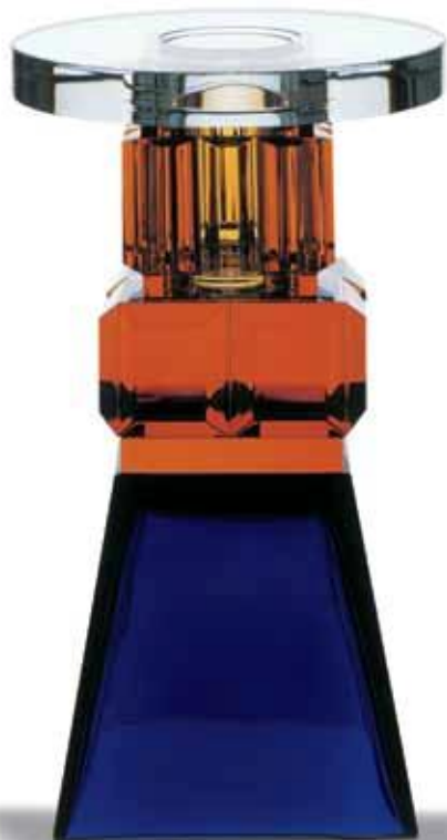
Ninurta vase designed by Ettore Sottsass Jr, 2002