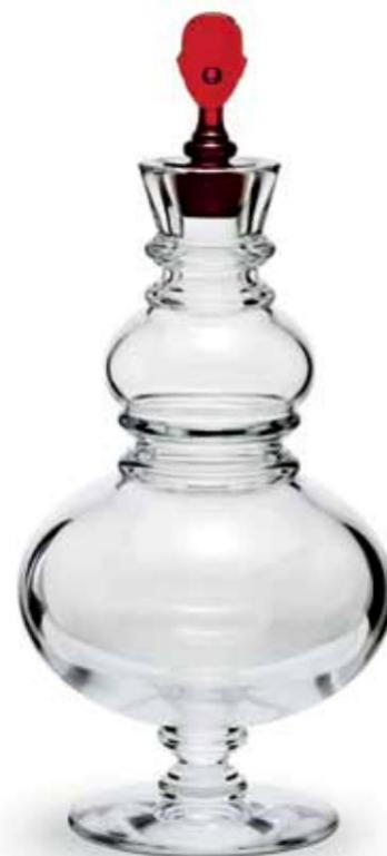
l'ivresse des bois decanter designed by Marcel Wanders