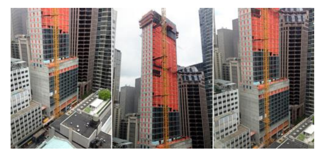
Here are a smattering of floorplans:

The residences came to market in March, and StreetEasy shows 16 listings in contract and 15 availabilities. The building website, however, has 13 active listings, including the $60 million penthouse and a duplex three-bedroom that has a terrace nearly as big as the entire apartment. Available one-bedrooms start at $3.4 million; two-bedrooms at $5.45 million; and three-bedrooms at $8.25 million. There is also one 4,545-square-foot four-bedroom, asking $23.5 million.